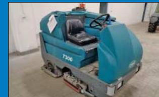
Tennant Model 7300 Electric Sit-Down Floor Scrubber