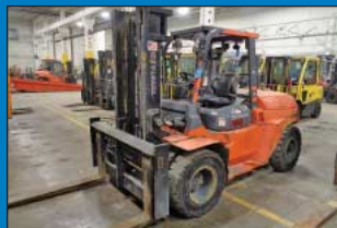
12,000 Lb. Toyota Model 7FDU60 Diesel Power Solid Pneumatic Tire Lift Truck (New 2008)