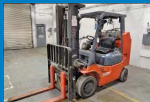
7,000 Lb. Toyota Model 7FGCU35-BCS LP Gas Cushion Tire Lift Truck (New 2012)