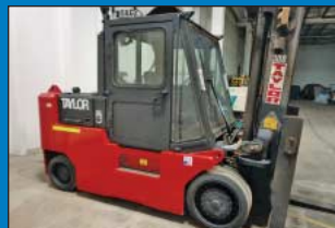
30,000 Lb. Taylor Model THC-300S Diesel Power Cushion Tire Lift Truck (New 2007)

See website www.cia-auction.com For Detailed Specifications, Photos, Link To Online Bidding And Terms Of Sale. Possible Additions, See Auction catalog for final list of available items.