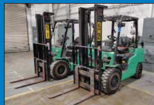
(2) 7,000 Lb. Mitsubishi Model FG35N LP Gas Solid Pneumatic Tire Lift Trucks (New 2010)