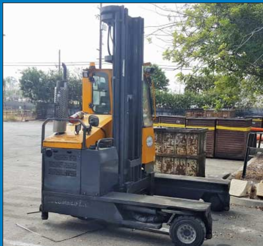
8,000 Lb. Combilift Model C8000 LP Gas Pneuatic Tire Multi-Directional Side Loader (New 2011)

Inspection for All Locations: Tuesday, December 20th from 10:00 AM to 4:00 PM