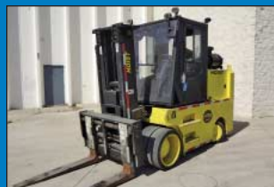
22,000 Lb. Silent Hoist Model FKS11 Diesel Power Cushion Tire Lift Truck (New 2010)