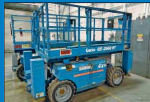
(3) Genie Model GS-2668RT Four-Wheel Drive All Terrain Scissor Lifts (New as 2008)