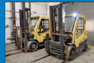
(6) 15,000 Lb. Hyster Model S155FT Diesel Power Cushion Tire Lift Trucks (New 2012)

See website www.cia-auction.com For Detailed Specifications, Photos, Link To Online Bidding And Terms Of Sale. Possible Additions, See Auction catalog for final list of available items.