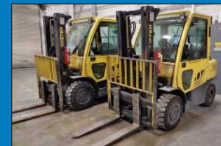
(5) 8,000 Lb. Hyster Model H80FT LP Gas Solid Pneumatic Tire Lift Trucks (New 2012)