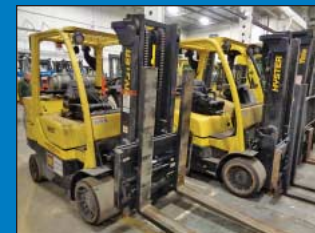
(3)10,000 Lb. Hyster Model S100FTBCS LP Gas Cushion Tire Lift Trucks (New as 2012)